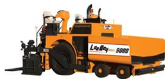
9000 Asphalt Paver