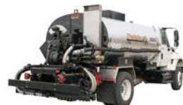
Maximizer 3 Asphalt Distributor