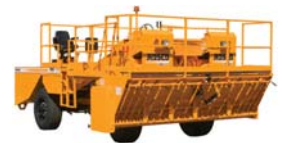
CSM-CSH Chip Spreader