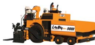
9000 Asphalt Paver