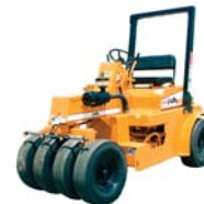
420 Pneumatic Roller