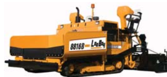
8816B Asphalt Paver