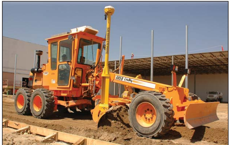
Pictured with customer-mounted Trimble GPS system.

The 685B Motor Grader is designed to deliver power, performance and durability at the jobsite. Whether building a road, cutting a ditch, preparing a work site or doing fine grading, the LeeBoy 685B Motor Grader is a versatile workhorse and features operator comfort and safety, easy control, and trouble-free operation.