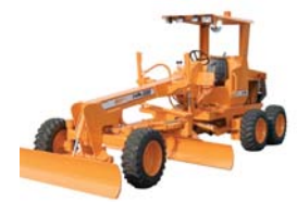
635B Motor Grader