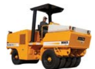
Tru-Pac 915 Pneumatic Roller